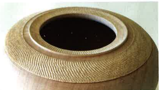
The inner rim of this hollow form was created with the round cutter and the outer band of texture was created with the end corner of the cylinder cutter at 30° to the work

TEXTURE SAMPLES AROUND THE EDGE FROM TOP LEFT. 1: Cylinder cutter presented corner on and traversed across the surface nine times 2: Cylinder cutter edge at 40° trailed across the work seven times from centre to outer edge 3: Bud-shaped cutter presented horizontal to a pre-shaped surface 4: A round cutter used at 10° off horizontal and a bud-shaped cutter tip used to create the small detail between the round cutter detail 5: The cylinder cutter end corner presented at various angles and colour used to highlight the detail