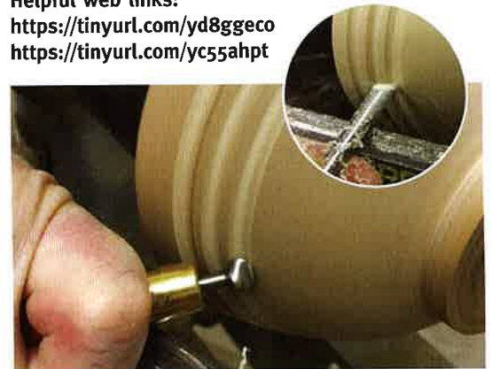
The round cutter being used on faceplate work in pre-cut covers