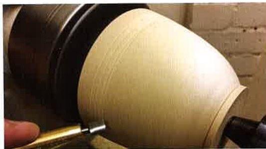
The cylinder cutter being used end corner on the faceplate work