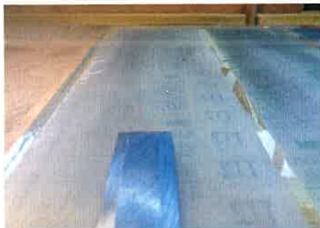
The chisels required some flattening before sharpening, but no more than expected

You'd be hard pressed to find a decent set of chisels that keep such a sharp edge at this price elsewhere, says Simon Frost